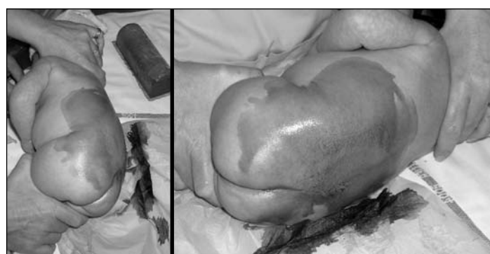
Figure 1. Lateral position to perform SA in 4kg newborn

Lumbar puncture is performed at L3-L4 or L4-L5 level. Various sizes and lengths of needles are available depending on the child's age. We use a 25G or 26G needle with stylet for neonates and infants (Figure 2). Using a needle without a stylet is not recommended since epithelial tissue can be deposited in the intrathecal space and may cause dermoid tumours of the neural axis.