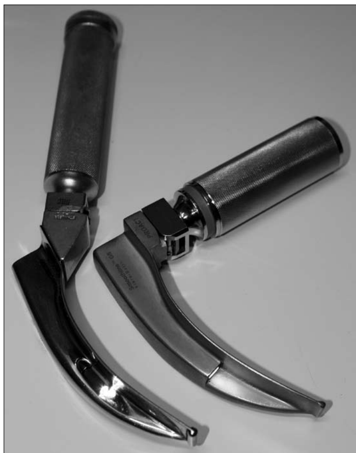
Figure 3. Polio laryngoscope blade and short laryngoscope handle